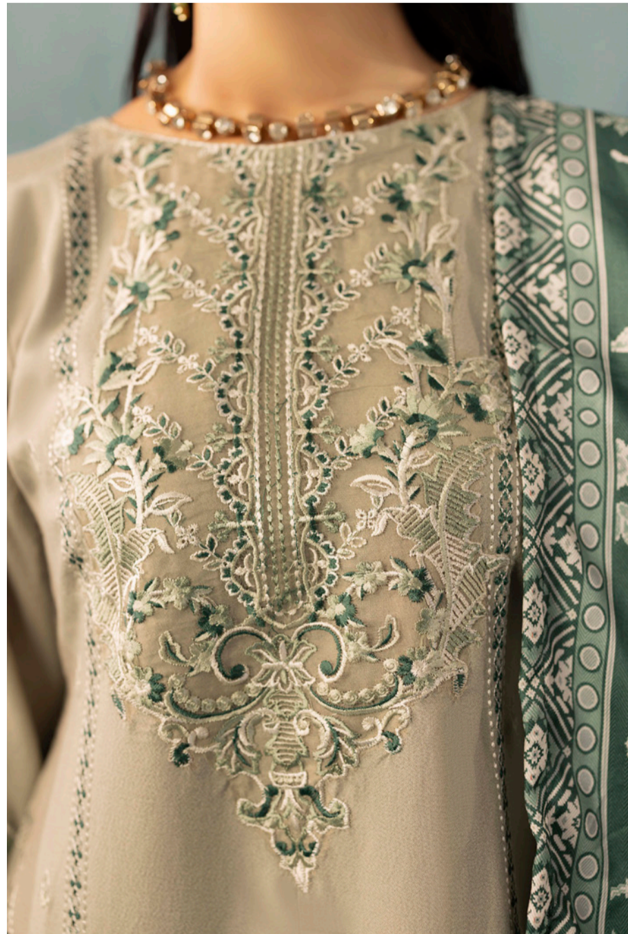
Ready To Wear Dhanak